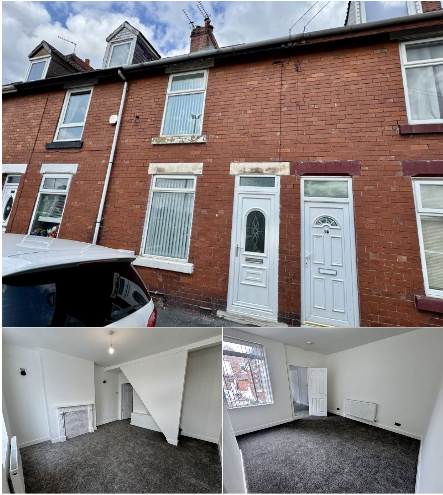
Queens Road , Carcroft, Doncaster, DN6 8HB

Rental £895 Monthly 4 Bedroom Terraced House Available Now