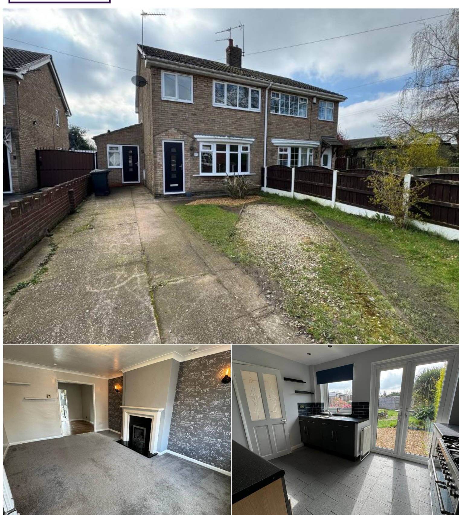
Field Road , Stainforth, Doncaster , DN7 5AQ